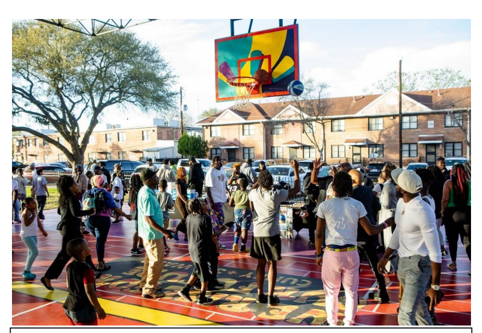
Cuney residents play on the newly revamped basketball court at Cuney Homes.